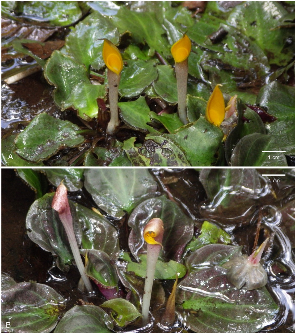
Fig. 3. Cryptocoryne aura , close-up of plants in Fig. 2. – A: newly opened spathes showing subobliquely twisted limb; B: older spathes showing forward-twisted limb.

Most species of Cryptocoryne have a rather undifferentiated embryo, which pushes through the distal end of the seed (micropylar end), and the root hairs can be seen at the “tip” of the embryo; just behind that, the plumular processes (prophylls) are seen pointing “backwards”. After further growth, more roots and leaves appear. Most of the embryo remains inside the seed, where it serves to absorb the endosperm in order to feed the growing embryo during the initial stages. There are a few exceptions to this simple embryo in