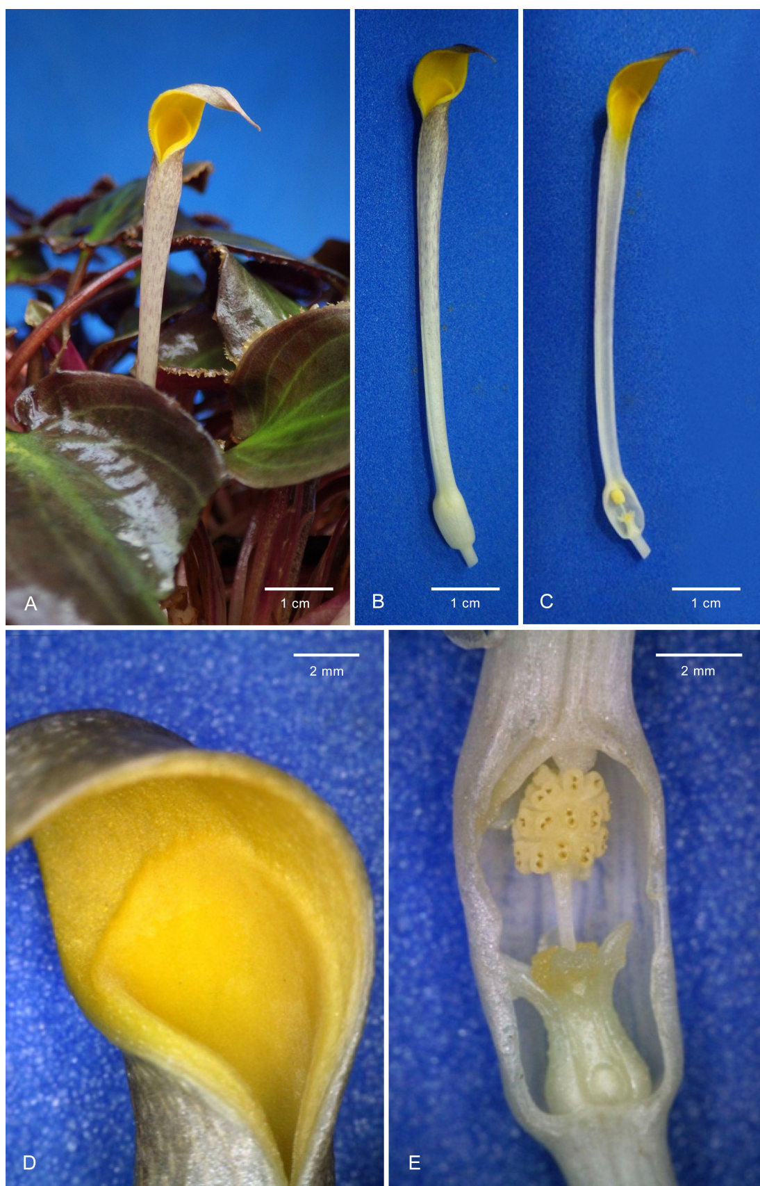
Fig. 5. Cryptocoryne aura – A: plant showing limb of spathe slightly subobliquely twisted (older spathe); B: limb of spathe bent forward at a younger stage than in A; C: spathe longitudinally cut open showing kettle in lower part; D: limb of spathe showing slightly raised collar; E: opened kettle showing female flowers below, olfactory bodies (yellow) above, sterile interstice, and male flowers above. – Photographs by S. Wongso.