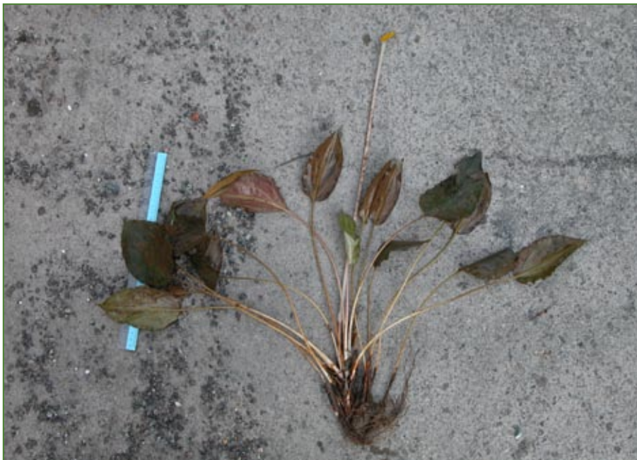
C. cordata var. cordata . Whole plant (scale 30 cm). Gunong Arong Recreational Forest, Johor, Malaysia. NJM 11-41.

3–6 cm broad and more or less red-brown, and main veins whitish rose to rose coloured, lower surface lighter. Spathe more than 10 cm long, limb yellow with a more or less pronounced brownish tinge, collar zone yellow.