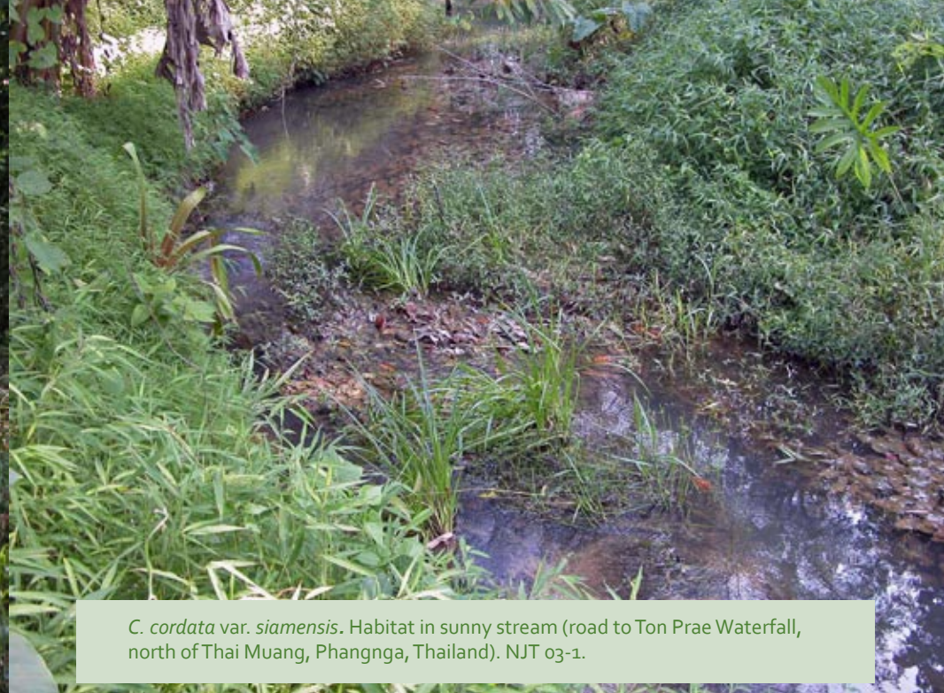
C. cordata var. siamensis . Habitat in sunny stream (road to Ton Prael Waterfall, north of Thai Muang, Phangnga, Thailand). NJT 03-1.

For many years the identity and understanding of the Cryptocoryne cordata complex has caused problems among botanists as well as aquarists. The first live introductions about 100 years ago were perhaps not so problematic as to the identification, but very problematic in cultivation. Since then plants have been imported every now and then under the name Cryptocoryne cordata , but very few plants survived and only a few flowering plants were documented.