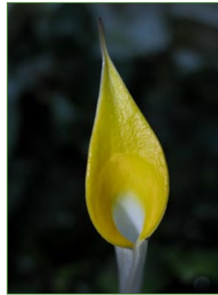
C. cordata var. cordata . Limb of spathe. East of Kahang, Johor, Malaysia. NJM 02-7.