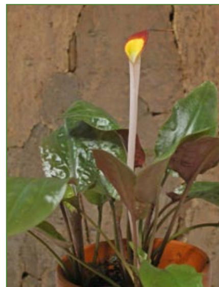
C. cordata var. grabowskii . Emergent cultivated specimen. Near Banjarmasin, Kalimantan. B 1020.