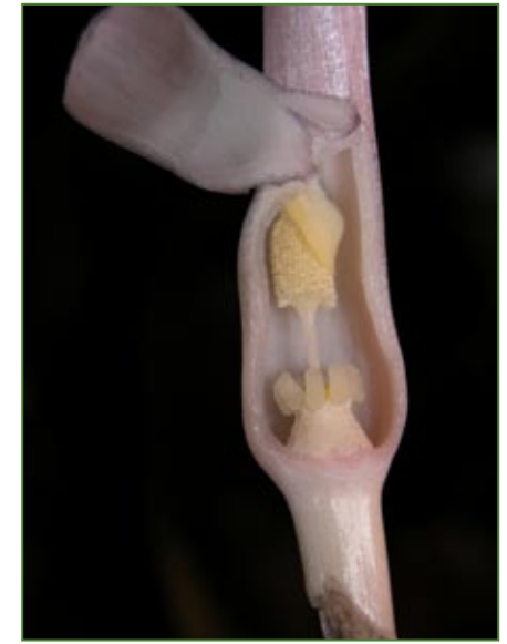
C. cordata var. cordata . Opened kettle from cultivated specimen, Toa Deng, Naratiwat, Thailand. NJT 02-26.