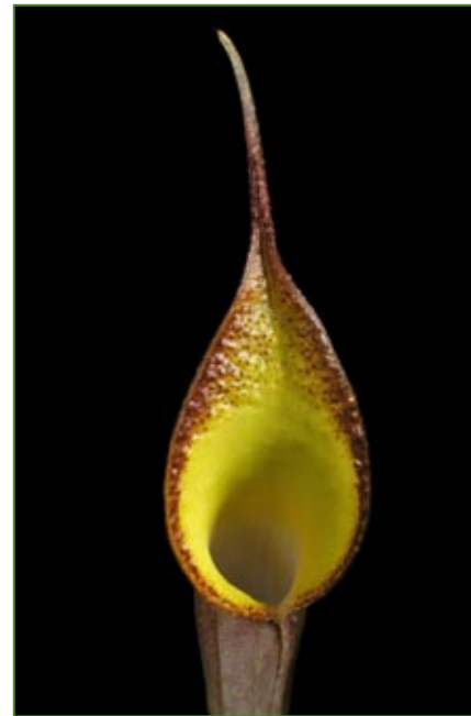
C. cordata var. diderici . Limb of spathe from cultivated specimen from Jambi province, Sumatera. B 1296.

Characteristics: C. cordata var. diderici is characterized by the dark green to olive brown ovate leaves, base more or less cordate, apex more or less rounded. Spathe 8–15 cm long, kettle inside whitish, limb ovate, acuminate, irregularly rough on the brownish to red brown surface, with a clear yellow demarcation zone toward the white tube opening. Spadix