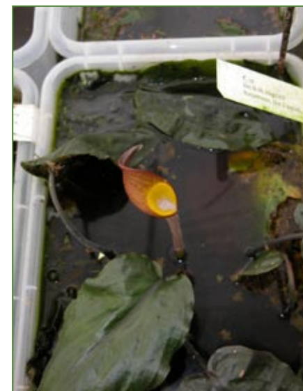
C. cordata var. grabowskii . Submerged cultivated specimen. Near Banjarmasin, Kalimantan. B 1003.

surface, smooth to strongly bullate. The spathe is up to 40 cm long, kettle inside white and purple spotted or with purple zone in the upper part or all purple; limb ovate, 3–5 cm long, surface yellow to brownish tinged, rough to verrucose; with a distinct yellow demarcation zone or with a bulge at the demarcation; spadix appendix purple spotted to almost purple.