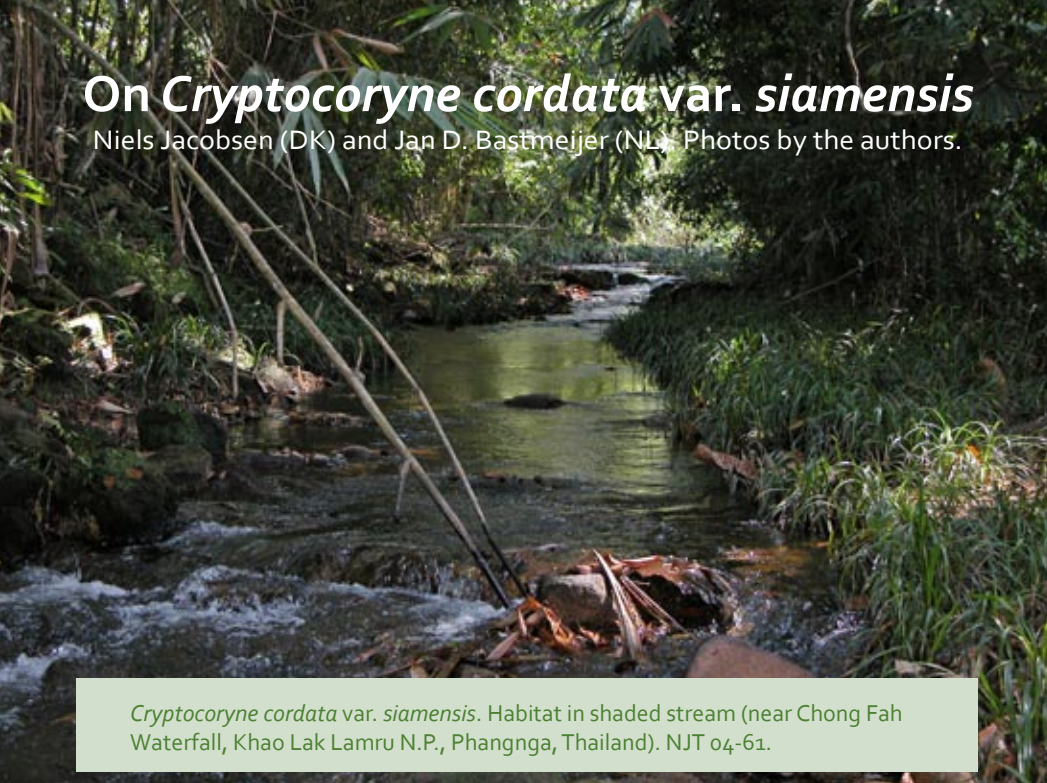
Cryptocoryne cordata var. siamensis . Habitat in shaded stream (near Chong Fah Waterfall, Khao Lak Lamru N.P., Phangnga, Thailand). NJT 04-61.