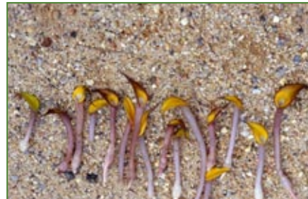
Above: C. cordata var. siamensis . Different spathe colours from one stream (road to Ton Prae Waterfall, N of Thai Muang, Phangnga, Thailand). NJT 03-1.