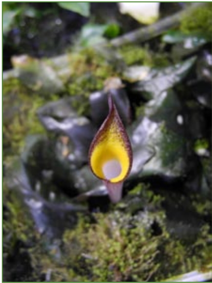
C. cordata var. diderici . Cultivated specimen from Jambi province, Sumatera. B 1296.