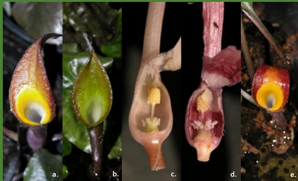
a. C. cordata var. siamensis . Brown limb of spathe (road to Ton Prae Waterfall, north of Thai Muang, Phangnga, Thailand). NJT 03-1. b. C. cordata var. siamensis . Just opened spathe in the morning (Cultivated plant from north of Sra Kaew Cave, Krabi, Thailand). NJT 02-17. c. C. cordata var. siamensis . Opened kettle from cultivated plant (east of Thung Ma-phrao, Phangnga, Thailand). NJT 02-57. d. C. cordata var. siamensis . Opened kettle from cultivated specimen (road to Ton Prae Waterfall, north of Thai Muang, Phangnga, Thailand). NJT 03-1. e. C. cordata var. siamensis . Limb of the spathe of the cultivar 'Rosanervig'. NJ 3417.

Characteristics: C. cordata var. siamensis is characterized by the