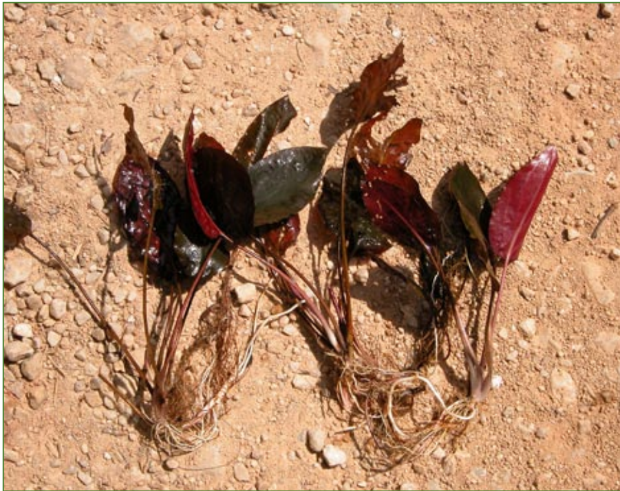
C. cordata var. siamensis . Red-leaved plants from a slow running stream (near Chong Fah Waterfall, Khao Lak Lamru N.P., Phangnga, Thailand). NJT 04-61.