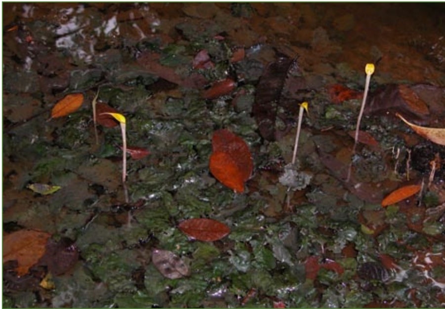
C. cordata var. cordata . Habitat in a stream east of Muadzam Shah, Pahang, Malaysia. NJM 11-50.