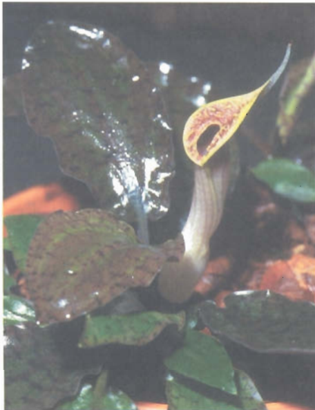
1c. Cultivated plant of Cryptocoryne xtimahensis .