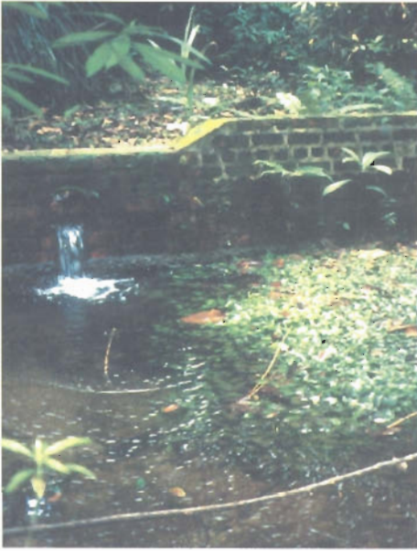
1a. Dammed pools on the Jungle Fall Stream in the Bukit Timah Nature Reserve, Singapore.