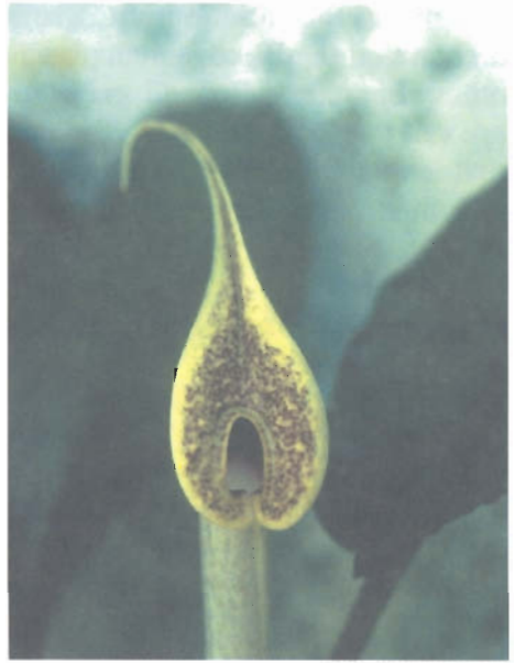
1b. Limb of the spathe of Cryptocoryne xtimahensis .